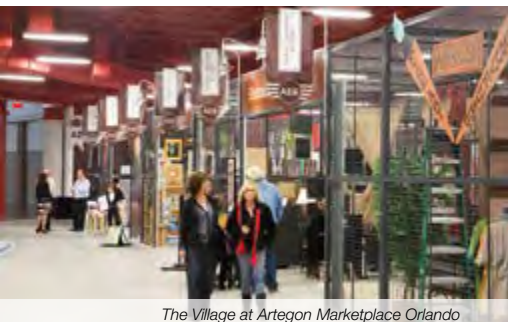
The Village at Artegon Marketplace Orlando

Artegon Marketplace Orlando is a 1.1 million-square-foot shopping attraction and artisan marketplace which opened in November 2014 in the heart of Orlando's tourism district on International Drive. The centre offers a totally new kind of shopping adventure unlike any other in the region. 165 one-of-a-kind artisanal shops and stores where local purveyors sell and demonstrate their products and services ranging from eco-friendly handbags and accessories, jewellery, hand-blown glass, mixed media artwork, custom clothing and locally-sourced foods. Artegon Marketplace also boasts some of the biggest brands in dining and retail, including the area's only Bass Pro Shops, Ron Jon Surf Shop and Toby Keith's I Love This Bar & Grill, plus Cinemark Theaters. Rounding out the guest experience is Sky Trail, the world's first indoor high ropes course.