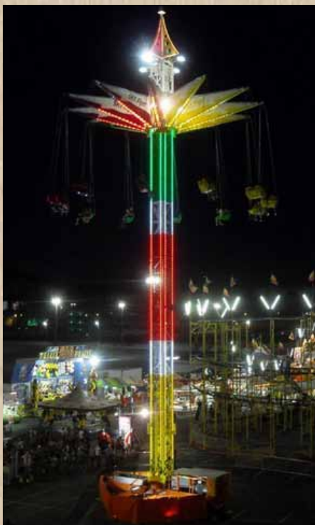
Strates Show's Sky Flyer