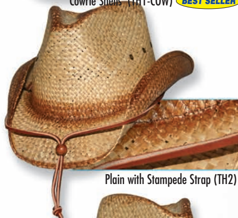
Plain with Stampede Strap (TH2)