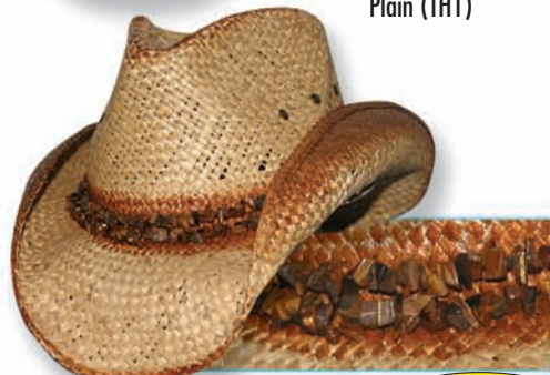
Tiger Eye (TH1-TIG) BEST SELLER