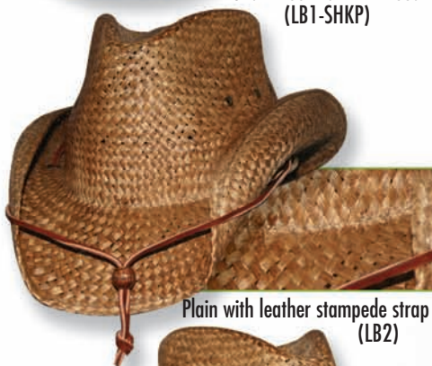
Plain with leather stampede strap (LB2)