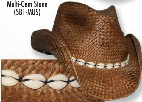
Small Cowrie Shells (SB1-COWSM)