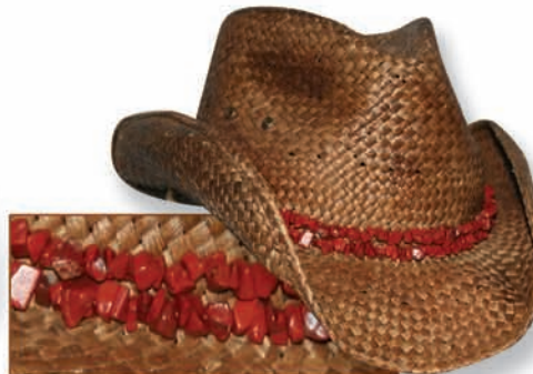
Red Jasper (SB1-RJA)