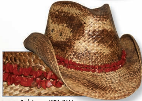
Red Jasper (FB1-RJA)