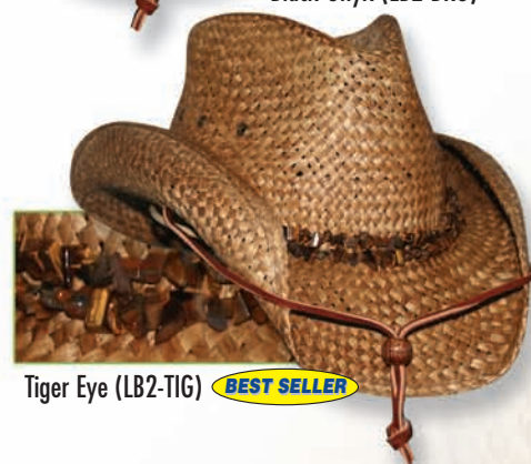
Tiger Eye (LB2-TIG) BEST SELLER