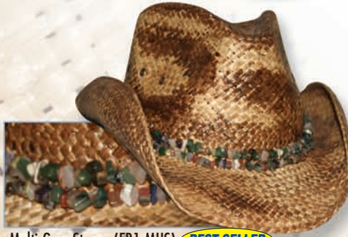
Multi-Gem Stones (FB1-MUS) BEST SELLER