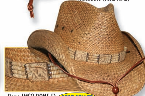
Bone (MS2-BONE-F) BEST SELLER

All Mexican Sunset Drifters are available with (MS2) or without stampede straps (MS1). Please ask our sales agents for any combination you prefer even if you do not see it pictured. We will be happy to help you get the Drifters you want!