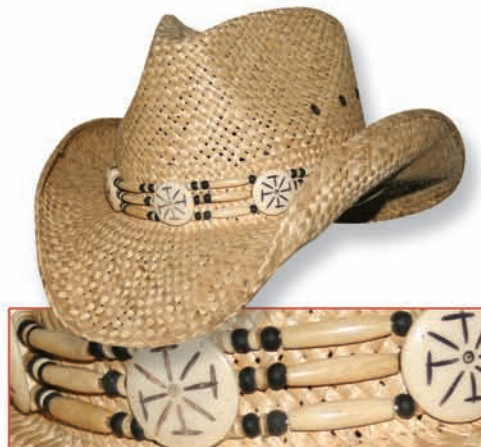
Bone C (BONE-C) engraved white bone