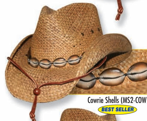
Cowrie Shells (MS2-COW) BEST SELLER