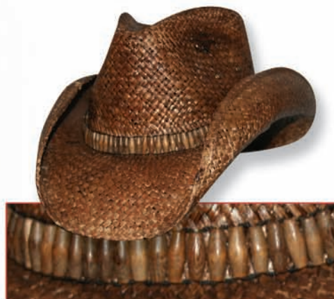
Brown Wood (BROWNW)

Please ask our sales agents for any combination you prefer. We will be happy to help you get the Drifters you want!