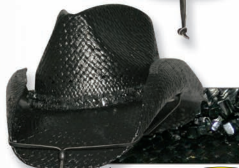
Black Onyx (BL2-BKO) BEST SELLER