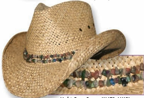
Multi-Gem Stone (NAT1-MUS)