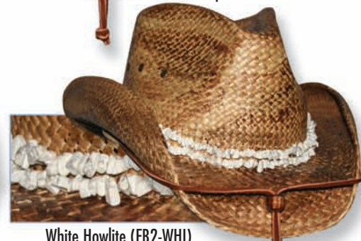
White Howlite (FB2-WHI)