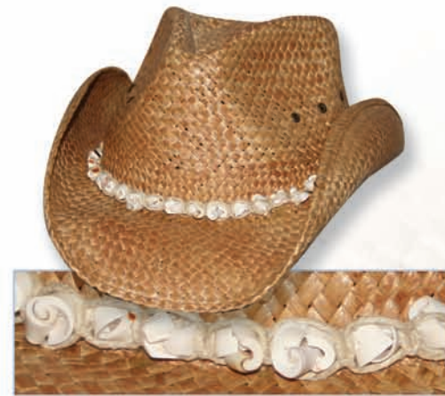
White Cut Shells (WCS)