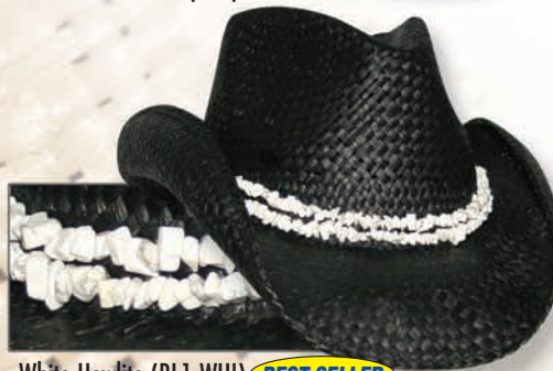
White Howlite (BL1-WHI) BEST SELLER