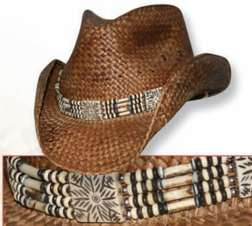
Bone A (BONE-A) BEST SELLER white engraved bone, with white and black beads