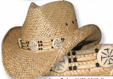
Bone Choker (NAT1-BONE-C)