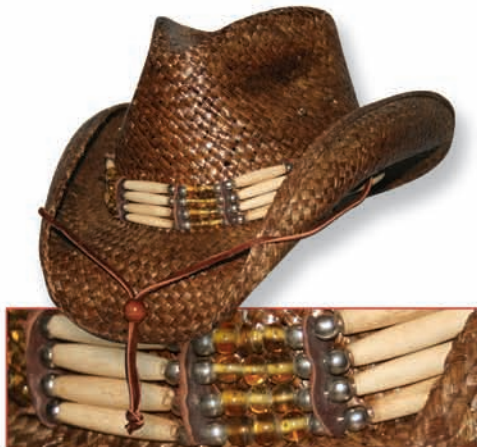
Bone B (BONE-B) white hairpipe with leather and beads