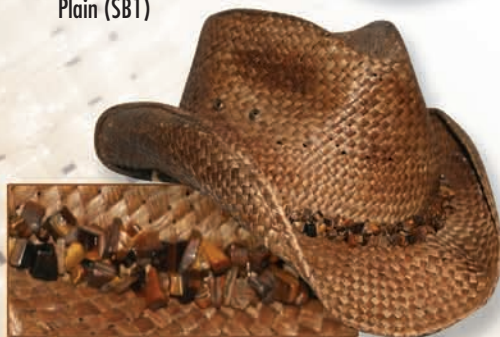
Tiger Eye (SB1-TIG)