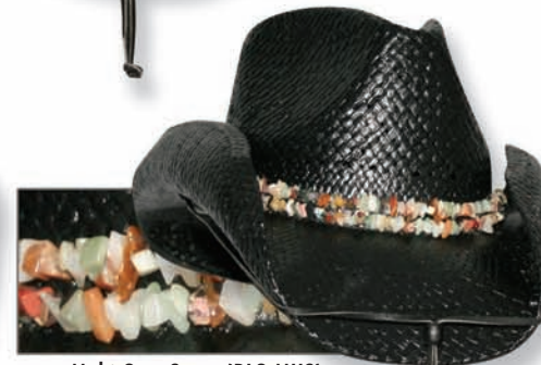
Multi-Gem Stone (BL2-MUS)