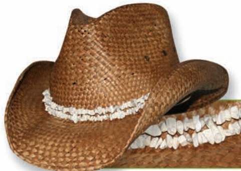
White Howlite (LB1-WHI)