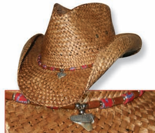
Shark with Confederate Flag Beads (SHKCF)