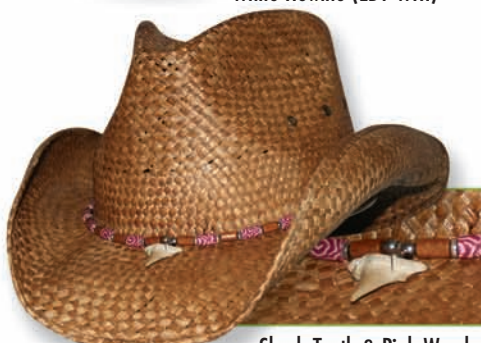
Shark Tooth & Pink Wood (LB1-SHKP)