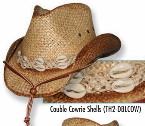
Cowble Cowrie Shells (TH2-DBLCOW)