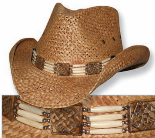
Brown with White Hair Pipe (BWWH) BEST SELLER