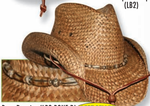
Bone Dressing (LB2-BONE-D) BEST SELLER

All Lighter Side of Brown Drifters are available with (LB2) or without stampede straps (LB1). Please ask our sales agents for any combination you prefer even if you do not see it pictured. We will be happy to help you get the Drifters you want!