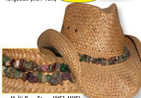
Multi Gem Stone (MS1-MUS)