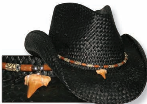
Shark and Brown Wood (BL1-SHKBR)