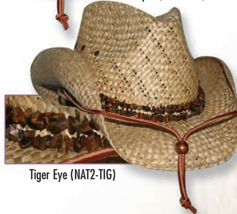
Tiger Eye (NAT2-TIG)