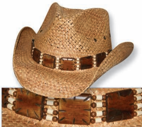
Brown Wood (BROWNW)