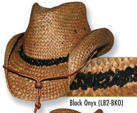
Black Onyx (LB2-BKO)