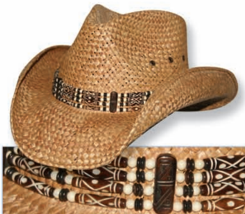
Dark Engraved Bone (DBEBW) BEST SELLER