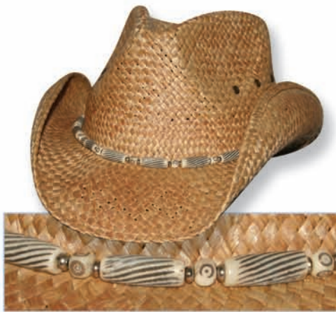
Engraved Bone (EB)