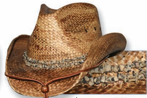
Dalmation Jasper (FB2-DAL)