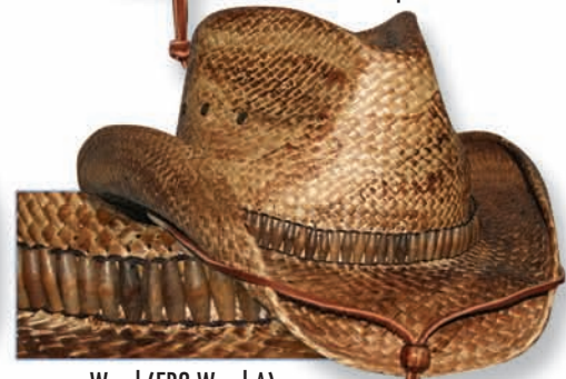
Wood (FB2-Wood A)

All Funky Brown Drifters are available with (MS2) or without stampede straps (MS1). Please ask our sales agents for any combination you prefer even if you do not see it pictured. We will be happy to help you get the Drifters you want!