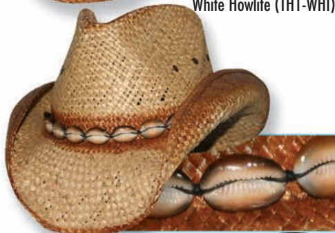
Cowrie Shells (TH1-COW) BEST SELLER