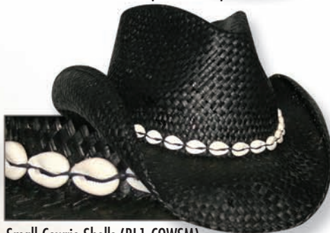
Small Cowrie Shells (BL1-COWSM)