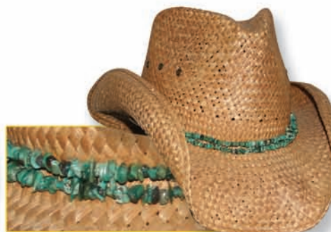
Turquoise (MS1-TUR) BEST SELLER