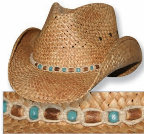
Hemp Weave with Wood and Stone (HWWS)