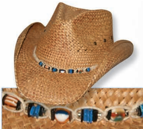
Hemp Weave with Stone (HWS)