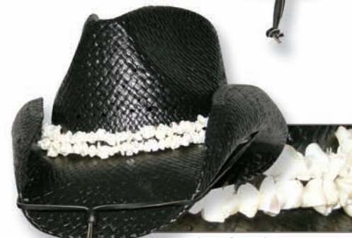
Mother of Pearl (BL2-MOP)