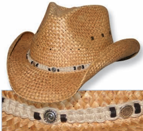
Hemp Weave with Medallion (HWM)