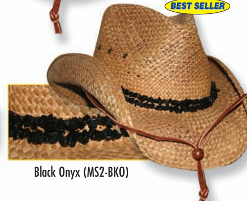
Black Onyx (MS2-BKO)