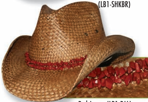
Red Jasper (LB1-RJA)