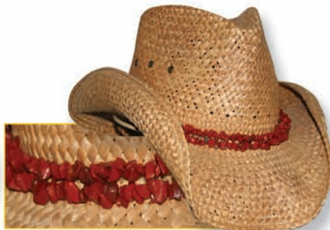
Red Jasper (MS1-RJA)