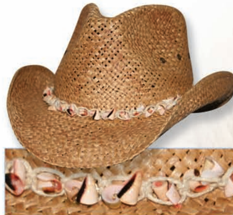
Natural Cut Shells (NCS)