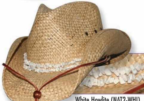
White Howlite (NAT2-WHI)