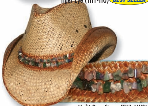
Multi-Gem Stone (TH1-MUS) BEST SELLER