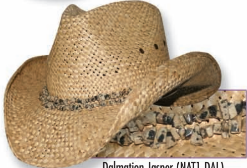
Dalmation Jasper (NAT1-DAL)