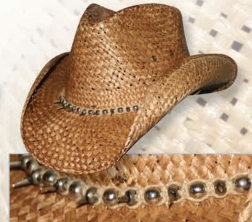
Hemp Weave with Spikes (HWSP)