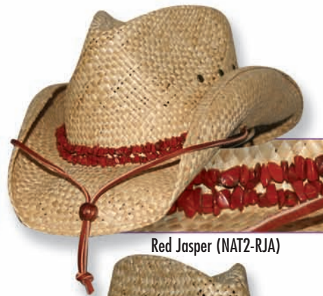
Red Jasper (NAT2-RJA)