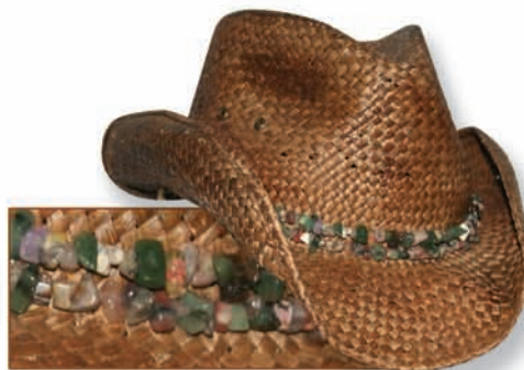
Multi-Gem Stone (SB1-MUS)