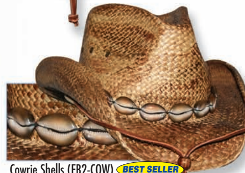
Cowrie Shells (FB2-COW) BEST SELLER