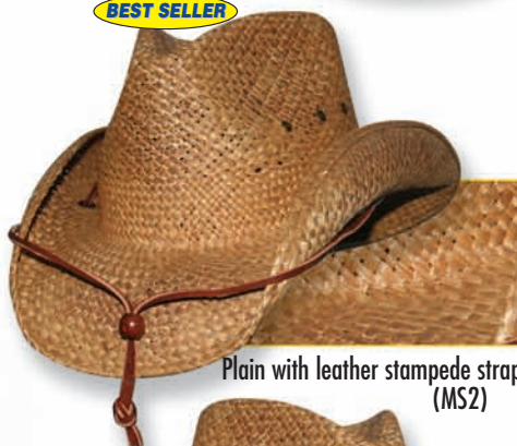
Plain with leather stampede strap (MS2)