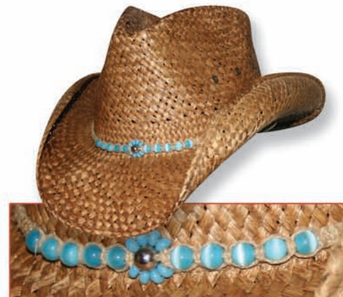
Ice Blue Beads (IBB)