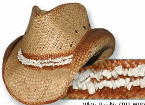
White Howlite (TH1-WHI)