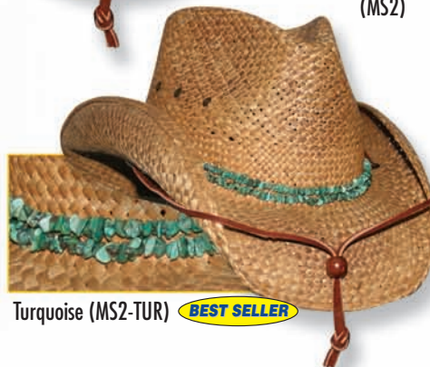
Turquoise (MS2-TUR) BEST SELLER