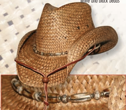
Bone D (BONE-D) BEST SELLER flame beads