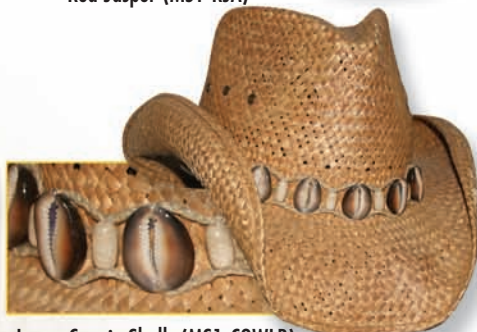
Large Cowrie Shells (MS1-COWL)