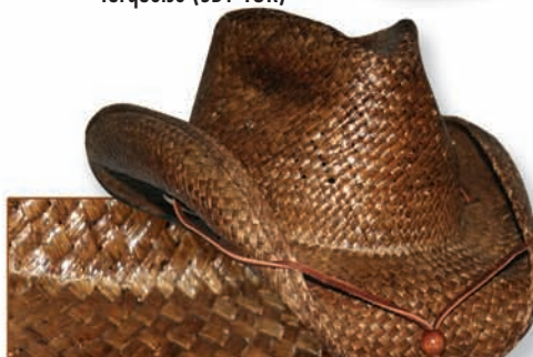
Plain with Stampede Strap (SB2)