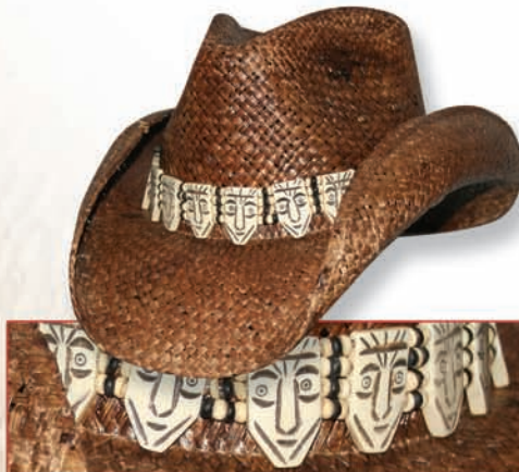
Bone E (BONE-E) BEST SELLER engraved two tone bone