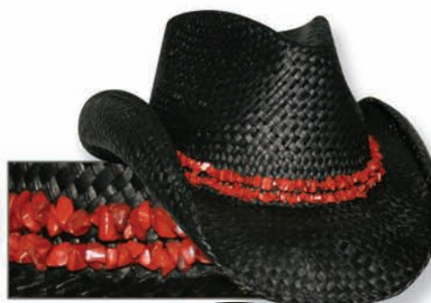
Red Jasper (BL1-RJA) BEST SELLER