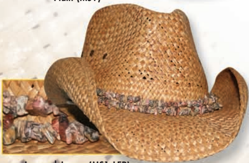
Leopard Jasper (MS1-LEP)