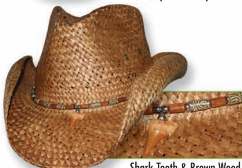
Shark Tooth & Brown Wood (LB1-SHKBR)