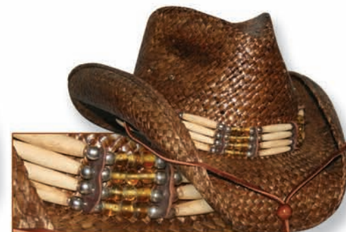
Bone Dressing (SB2-BONE-B)