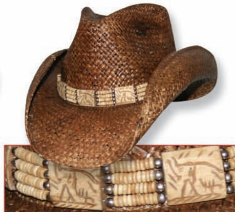
Bone F (BONE-F) engraved elephants on bone