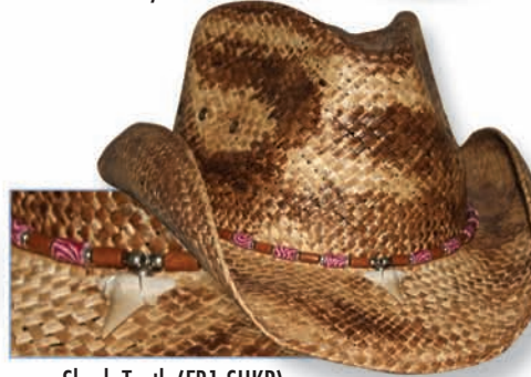
Shark Tooth (FB1-SHKP)