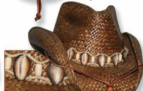
Large Cowrie Shells (SB2-COWLb)