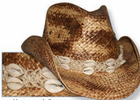
Double Cowrie Shells (FB1-COWDB)